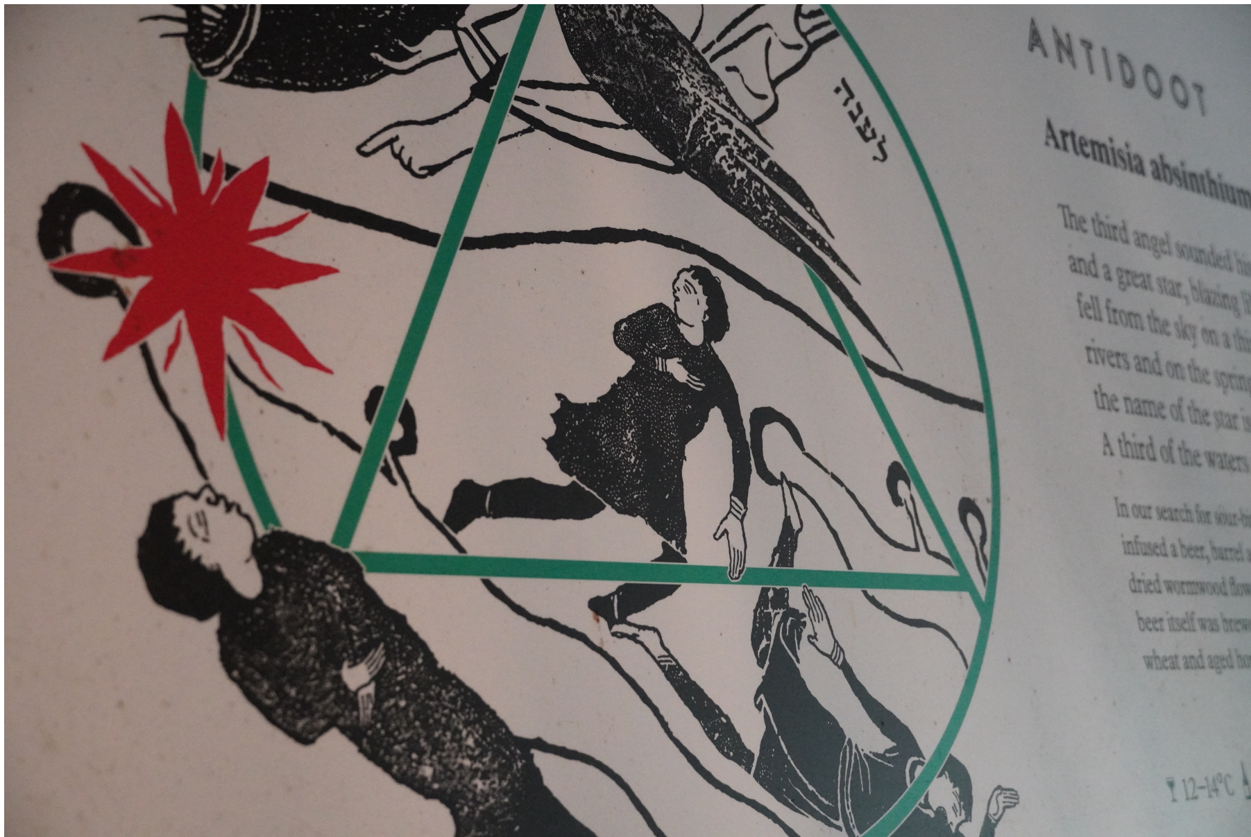
Close up of graphical signage within Antidoot facility near Kortenaakken, 2024.