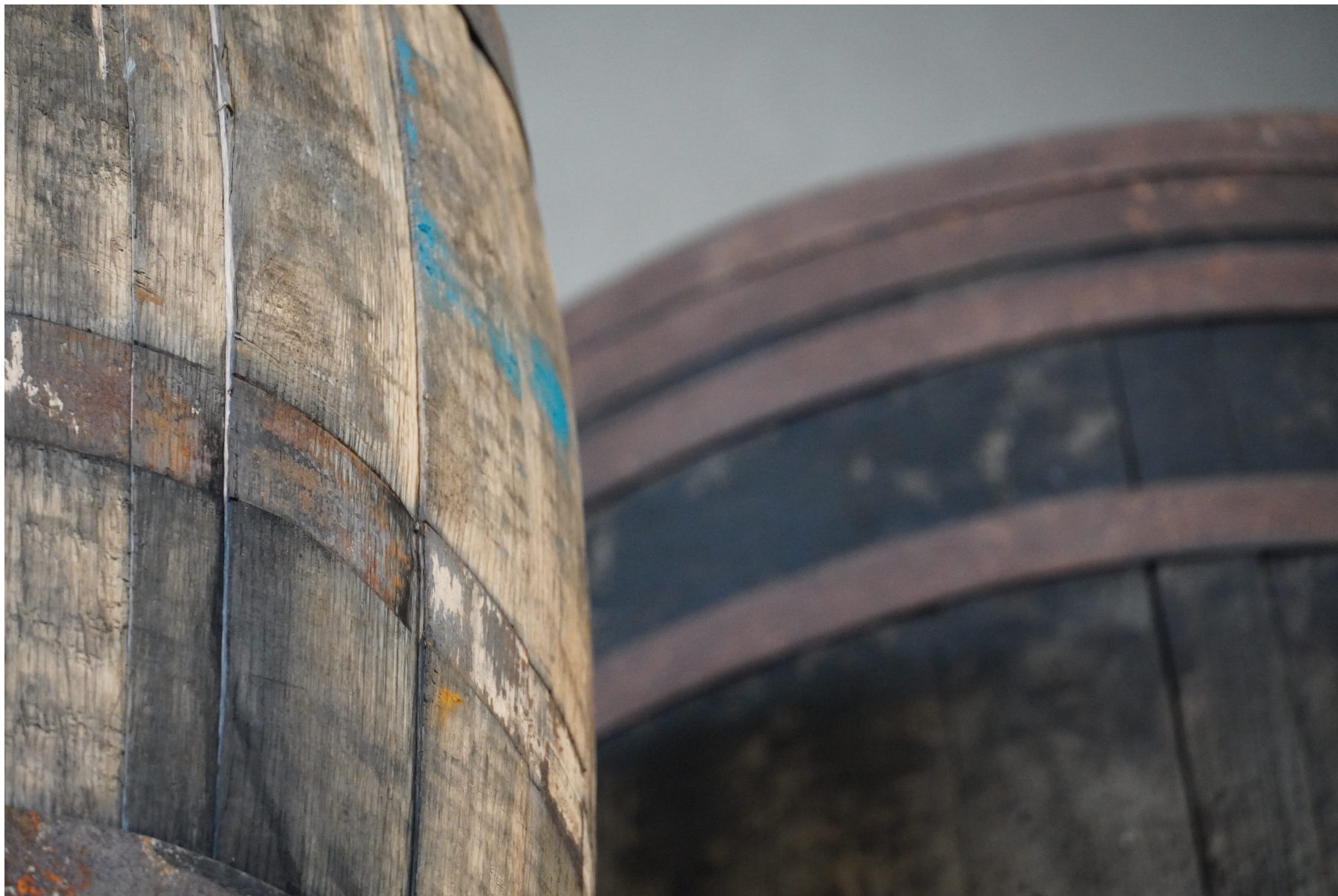
Former aging barrels at Bofkont facility, Kontich, 2023.