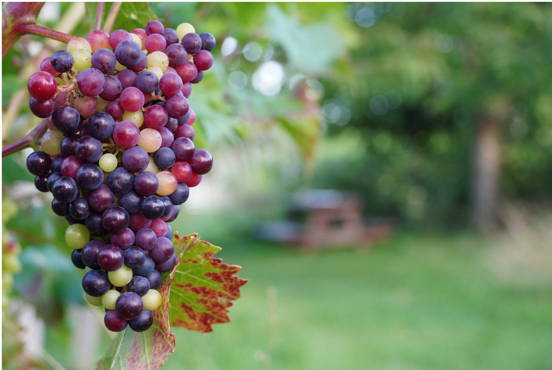
Grapes in orchard of Antidoot , near Kortenaken, 2023.