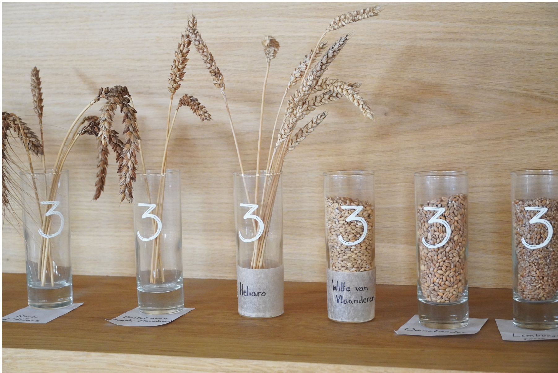
Grains used in brewing and blending on display at 3 Fonteinen , Beersel, 2023.