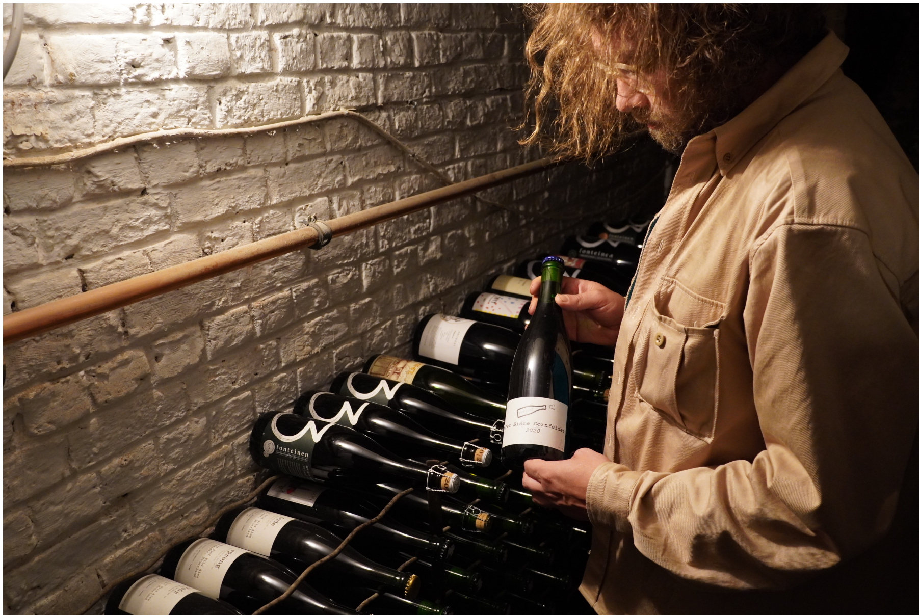
Exploring and discovering different fermented wild ales in cellar, Antwerp, 2023.