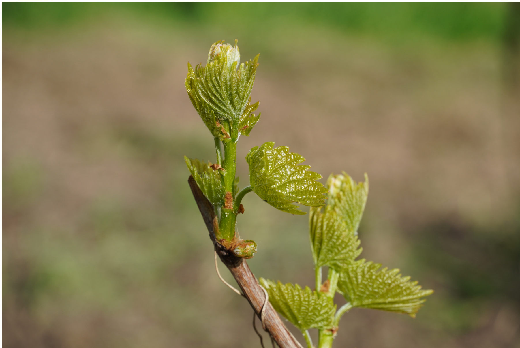
Grape saplings in Jacobs' orchard, Kortenakken, 2024.