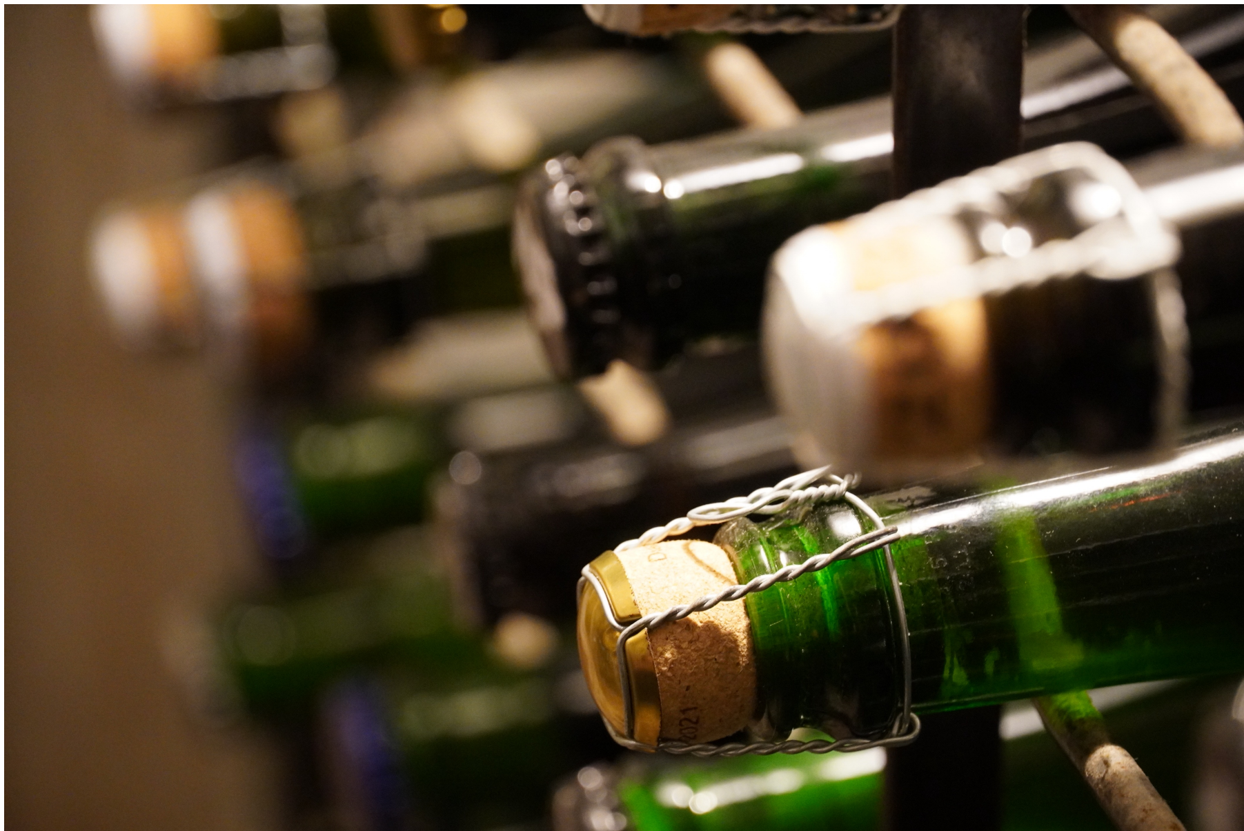
Documentation of fermented wild ales in cellar, Antwerp, 2023.