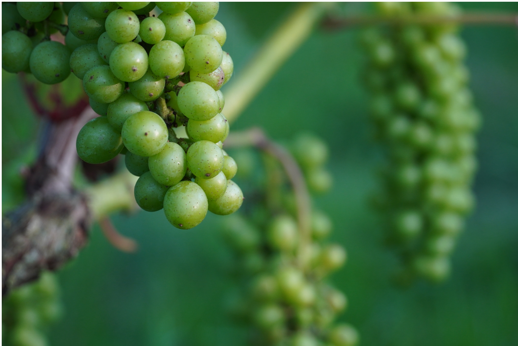
Grape varieties at Antidoot orchard during BoA's initial tour, Kortenakken, 2023.