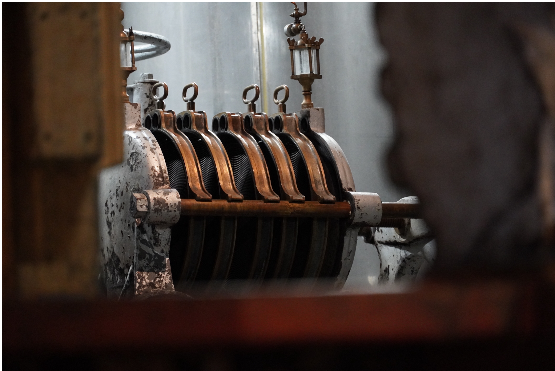
Brewing equipment within Cantillon seen during research, Brussels, 2023.