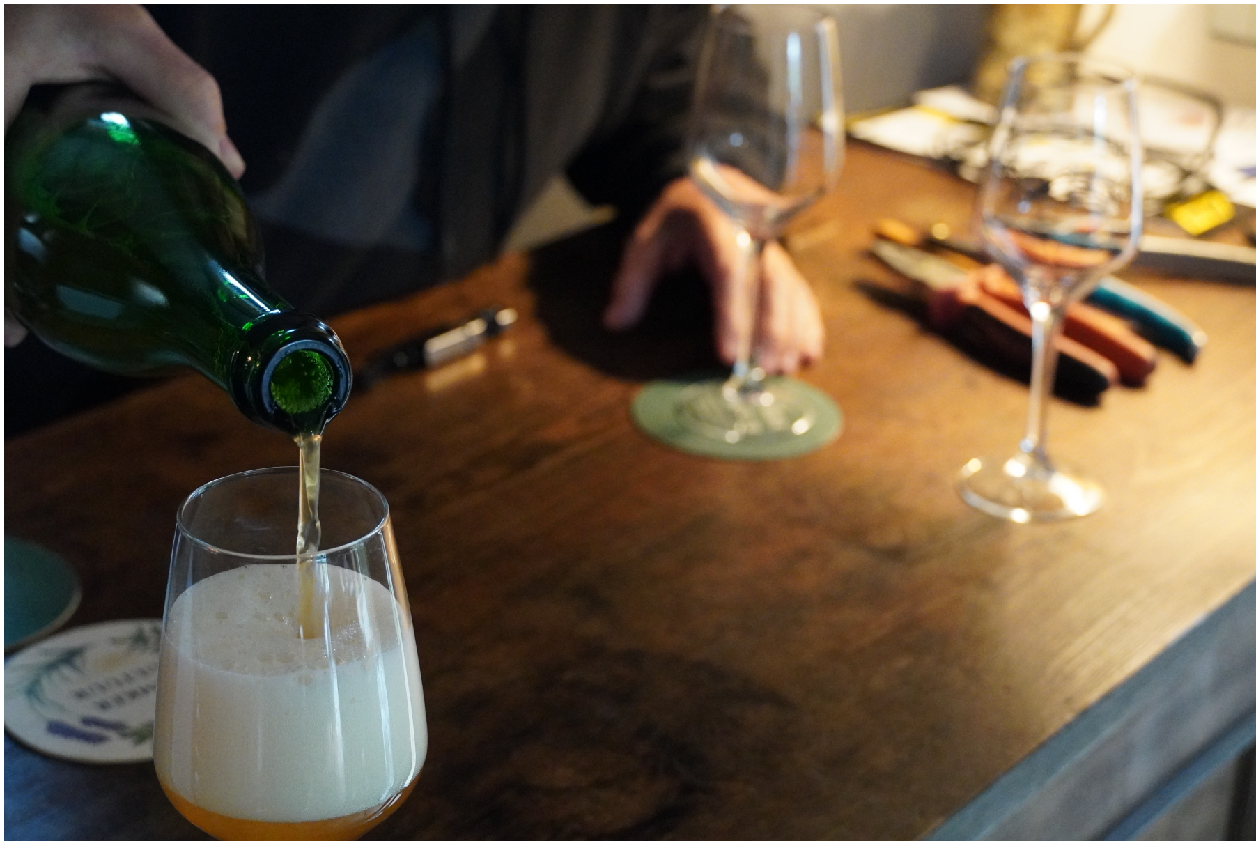
Sampling wild ales at Antidoot , Kortenaakken, 2024.