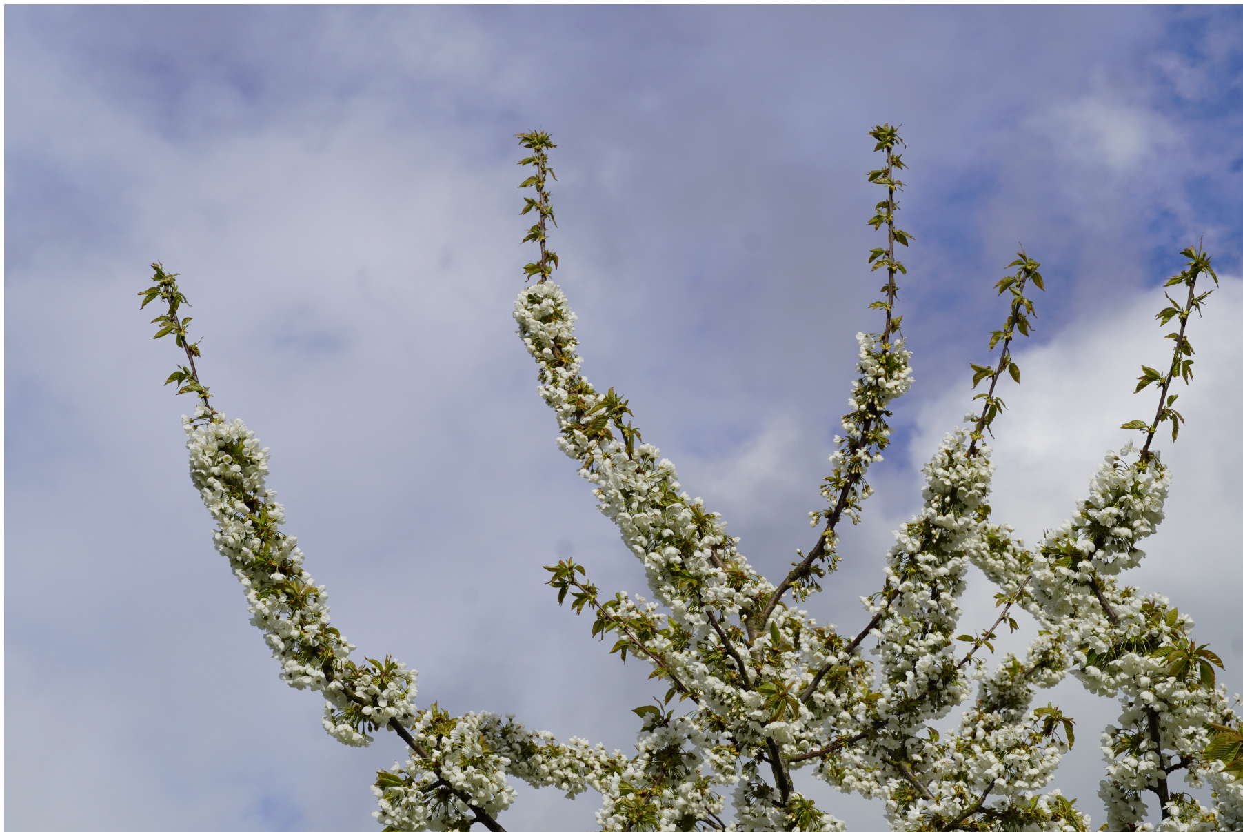
Fruit tree branches during springtime on Bureau of Analogies tour of Antidoot orchard, Kortenaakken, 2024.