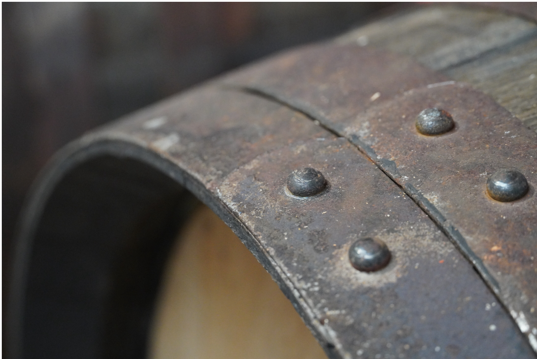
Detail of aging barrel inside Bofkont facility, Kontich, 2023.