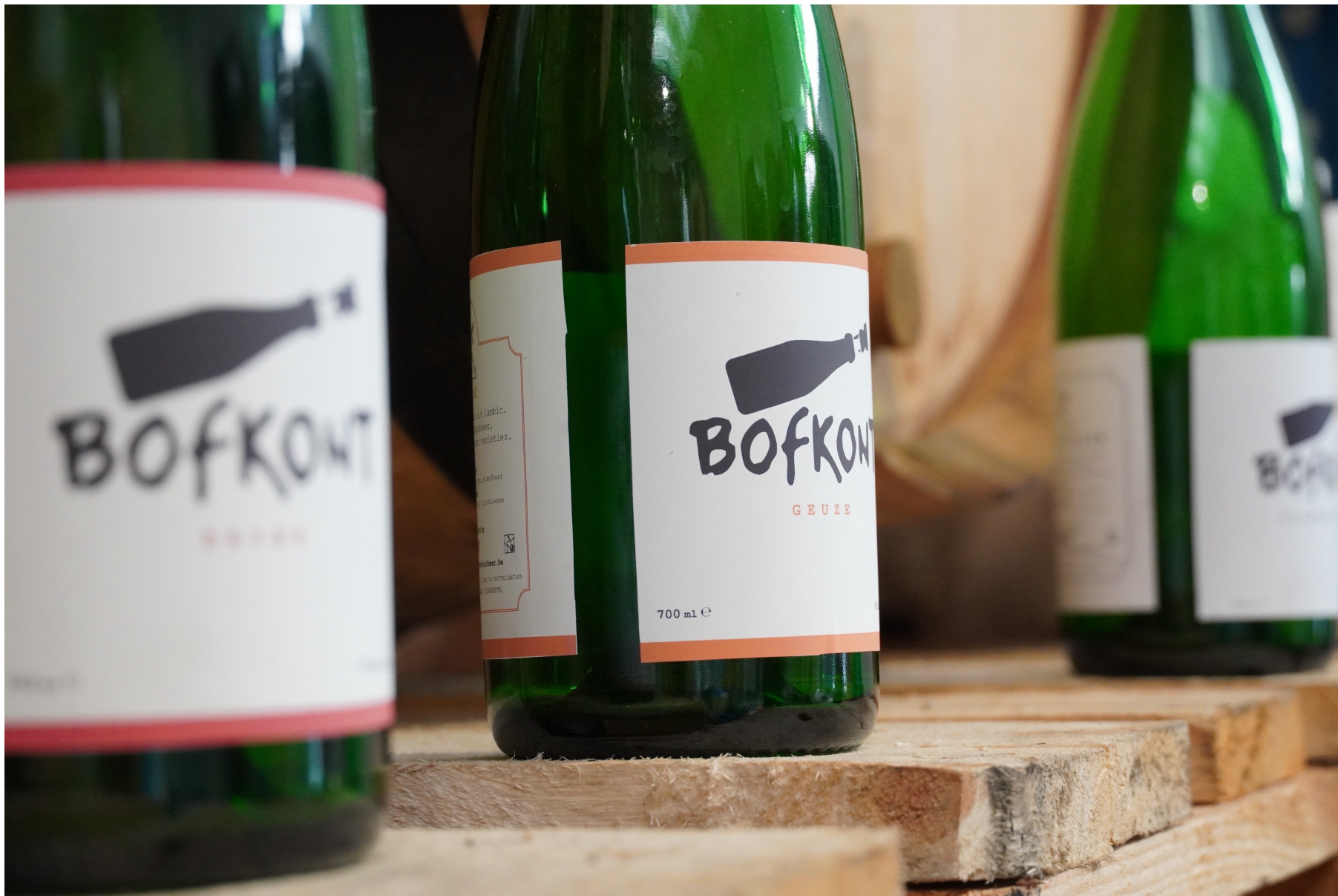
Different varieties of fermented wild ale blends at Bofkont facility, Kontich, 2023.