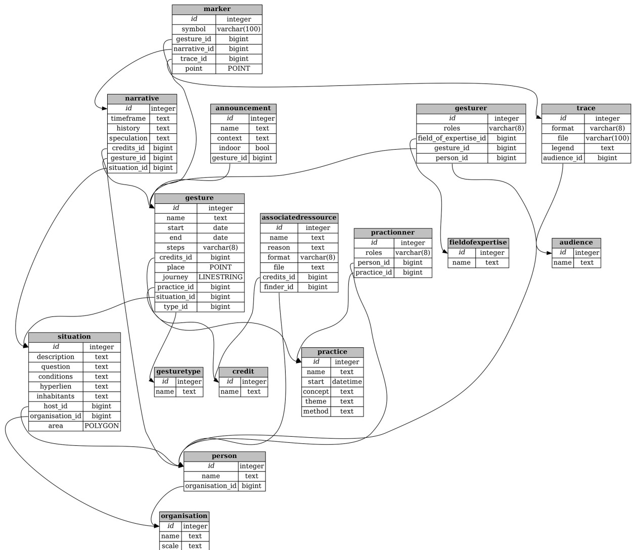
20230109_Workshop_Class Diagram Updated

work with us know that they will have to pay the equivalent of what a self-employed person needs to live in society. We realize that the other contributors in this project, artists and researchers, have similar needs, that at this point are not fully met. However, we bring to each new project what we have built up over a long period of time with other institutions through the open source practices initiated in other projects. So there is a mutualization of costs that takes place across different projects. This limits costs, avoids starting from scratch and ensures that the code of this mapping tool survives and grows in a way. On the other hand, we have decided to work on this project together, by also investing extra time and financial resources in it. In that way, we are not only those who design the map, but also one of those who pay for it and put it to value by building further on it in the future.